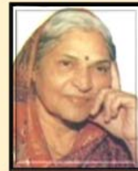
Hon'ble Smt. Puspatai Hiray