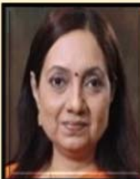
Hon'ble Smt. Smitatai Hiray