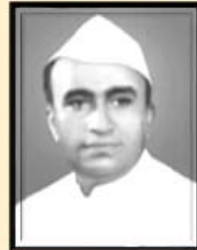
Late Loknete Vyankatrao Hiray