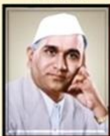
Late Karmveer Bhausaheb Hiray